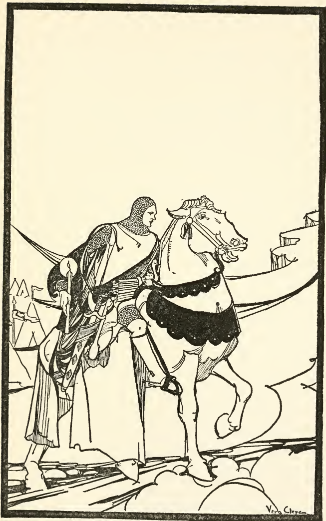
RANIERO RODE FORWARD AS IN A WHITE NIGHT